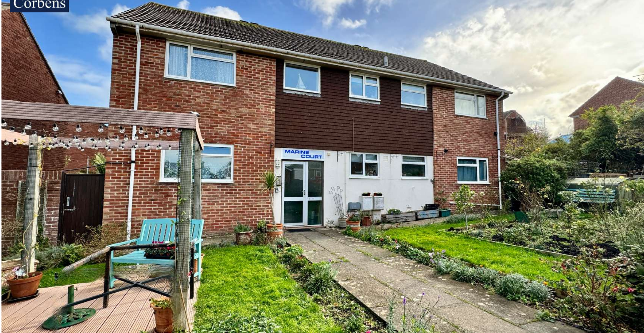
9 MARINE COURT, HOBURNE ROAD, SWANAGE £259,950 Leasehold