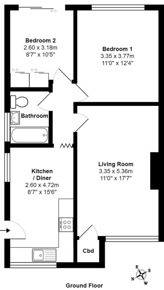
Total Area: 60.7 m<sup>2</sup> ... 653 ft<sup>2</sup>

All measurements are approximate and for display purposes only.