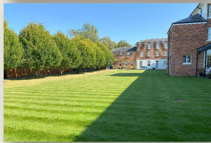
Viewing is Strictly by Appointment through Reaston Brown