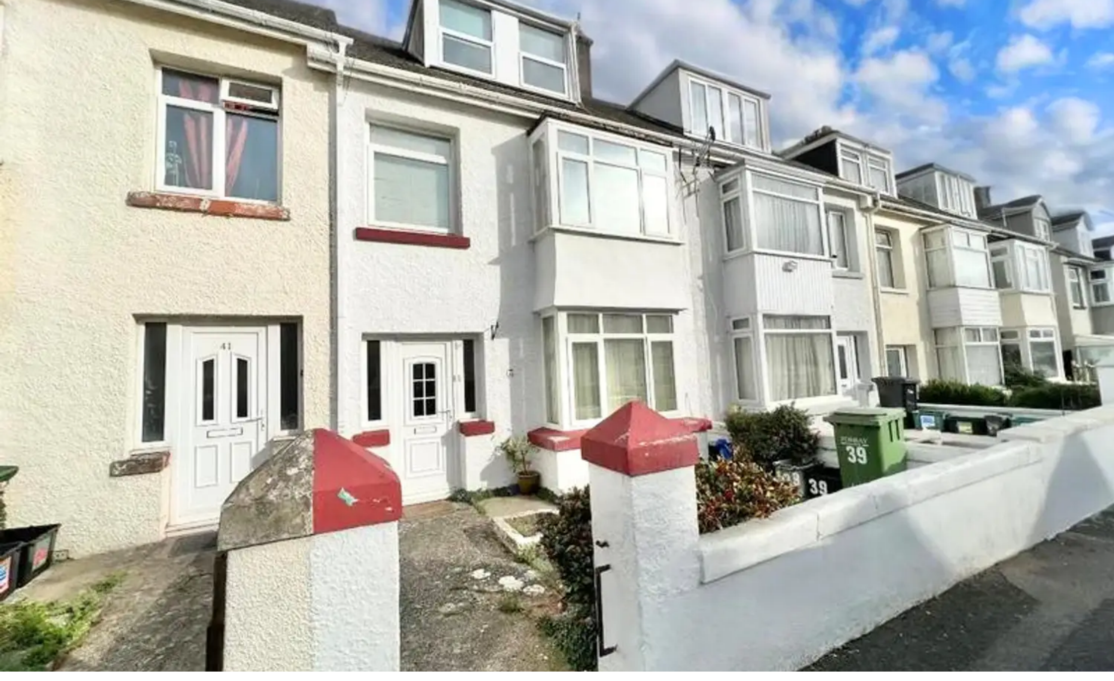
39 Second Avenue, Torquay - TQ1 4JD £250,000