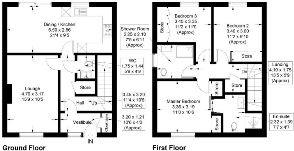
Illustration for identification purposes only, measurements are approximate, not to scale. floorplansUsketch.com © (ID1024166)

Approximate Gross Internal Area = 101.8 sq m / 1096 sq ft