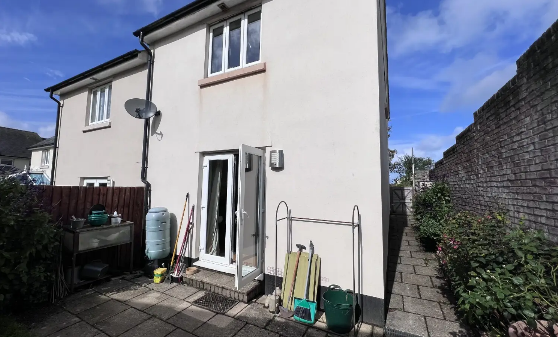
33 St. Marys Hill, Brixham - TQ5 9GX Offers Over £240,000