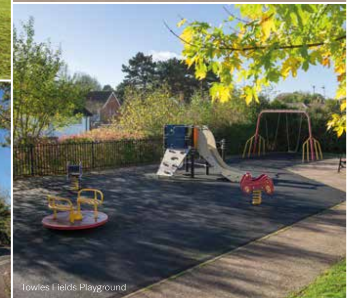
Towles Fields Playground

Our stunning new development consists of 70 plots that offer an excellent choice of 2-5-bedroom homes, all beautifully designed inside and out.