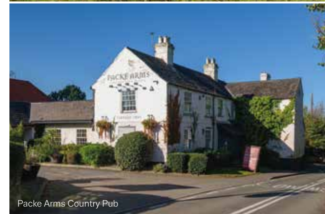
Packe Arms Country Pub