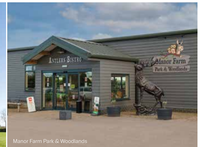
Manor Farm Park & Woodlands