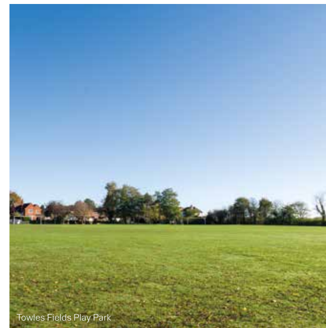
Towles Fields Play Park

Burton on the Wolds has something for everyone, with plenty to see and do right on your doorstep. From schools, nurseries and churches to cafes, restaurants, salons and barbers, most of life's essentials are all within a 10-minute drive of your new home. So, whether you're a couple, growing family or looking to downsize to a more peaceful location, there is something for everyone at Honeysuckle Rise.