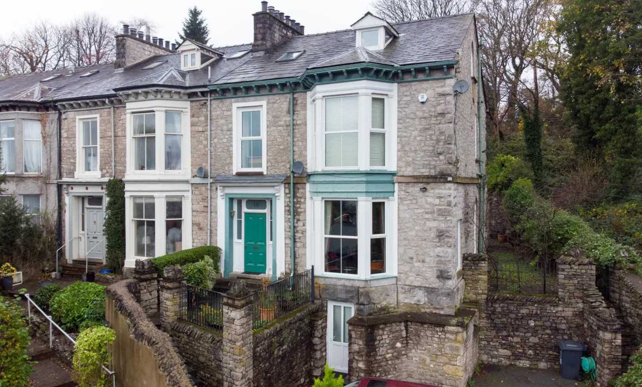
16 Horncop Lane, Kendal £700,000