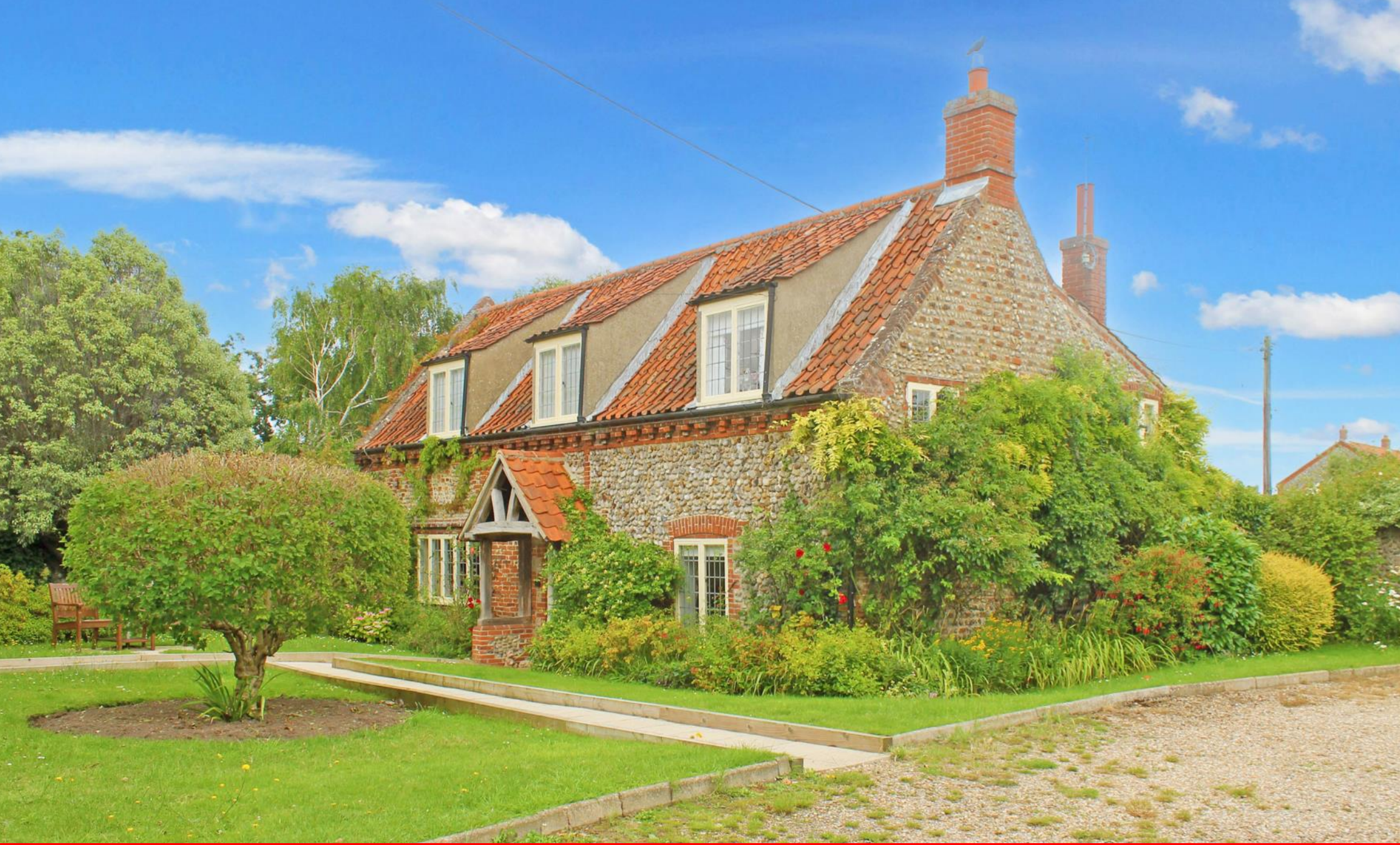
Rowan Cottage, Langham

See all our properties at OnTheMarket.com