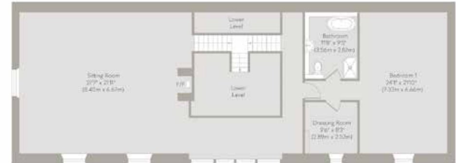
First Floor Approximate Floor Area 1309 sq. ft. (121.61 sq. m)