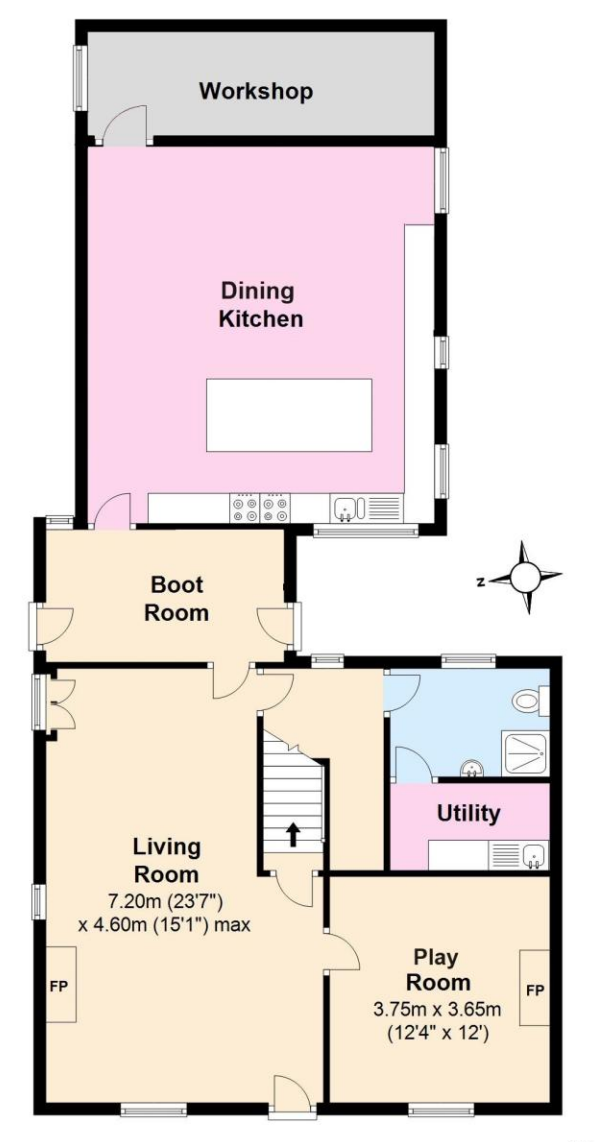
First Floor Approx. 58.9 sq. metres (634.1 sq. feet)

Approx. 115.4 sq. metres (1241.9 sq. feet)