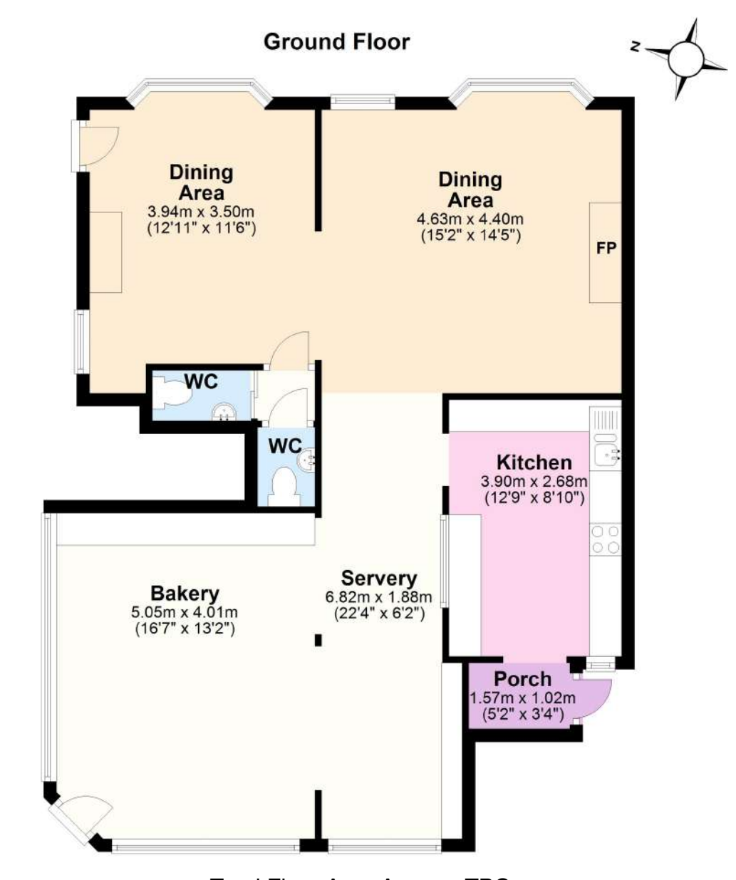
Total Floor Area Approx. TBC

15 The Parade £13,750 Current rates payable £6,173.75