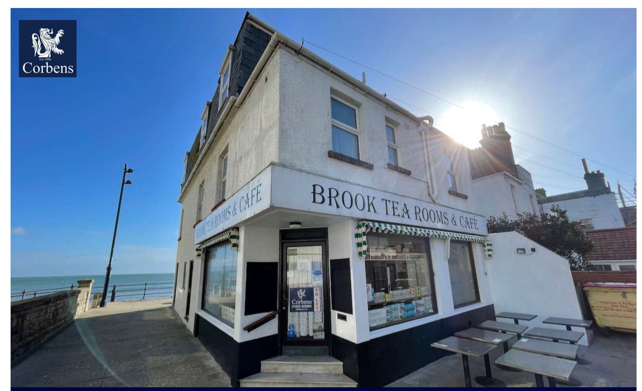
15, 15A & 14A THE PARADE, SWANAGE £925,000 FOR THE FREEHOLD