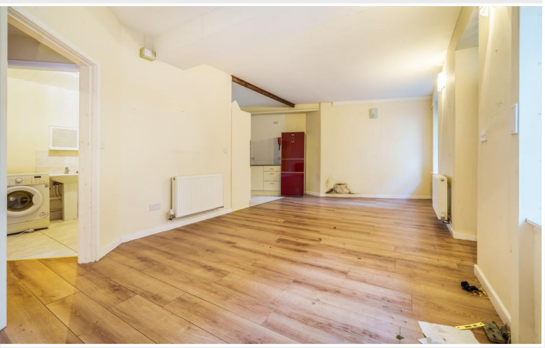
Open Plan Living/Dining Room