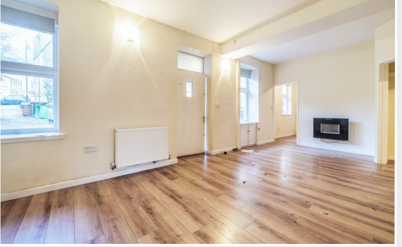
Open Plan Living/Dining Room