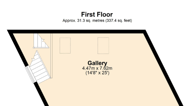
Total area: approx. 62.7 sq. metres (674.8 sq. feet)