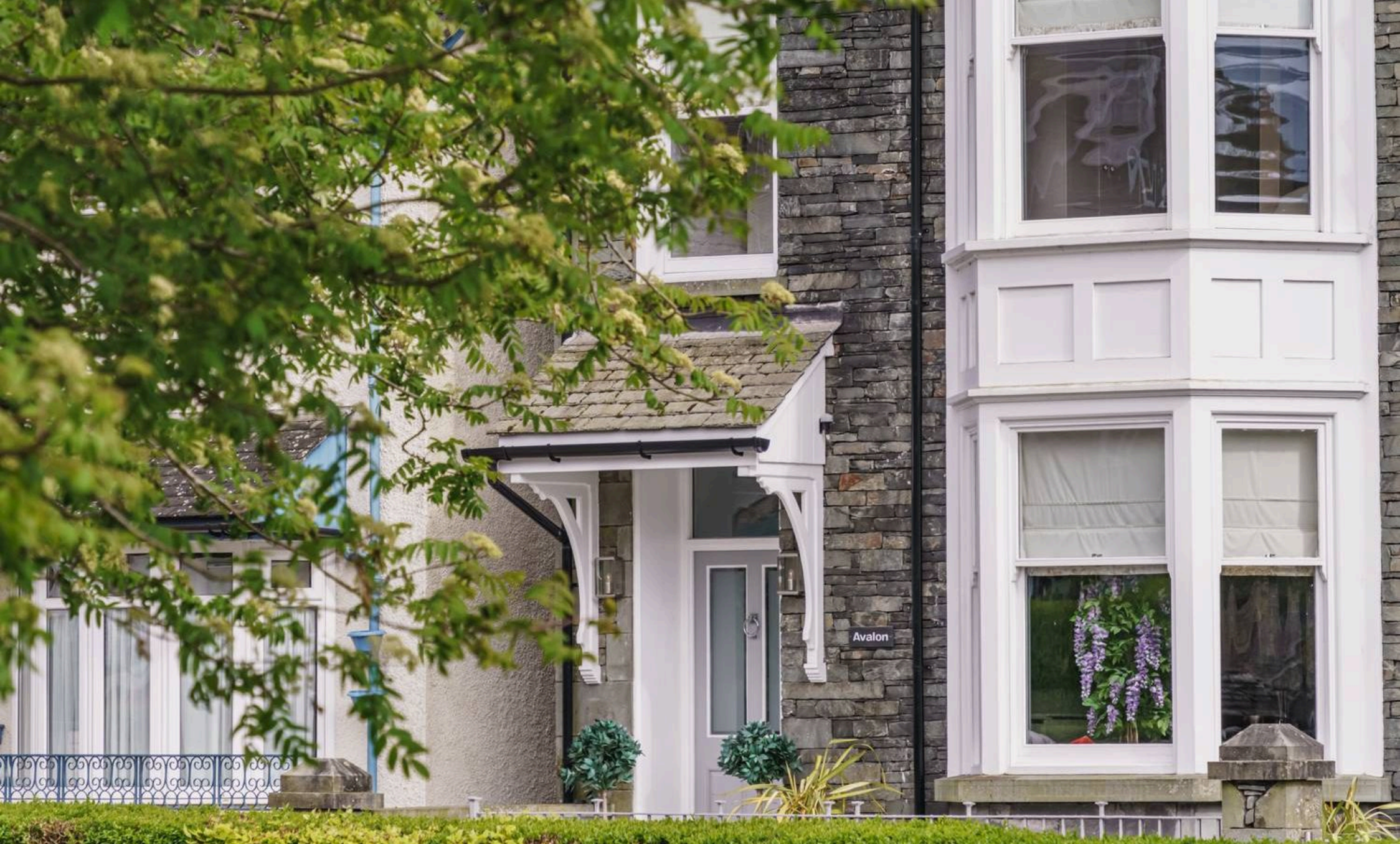
Avalon, Rothay Road £1,080,000