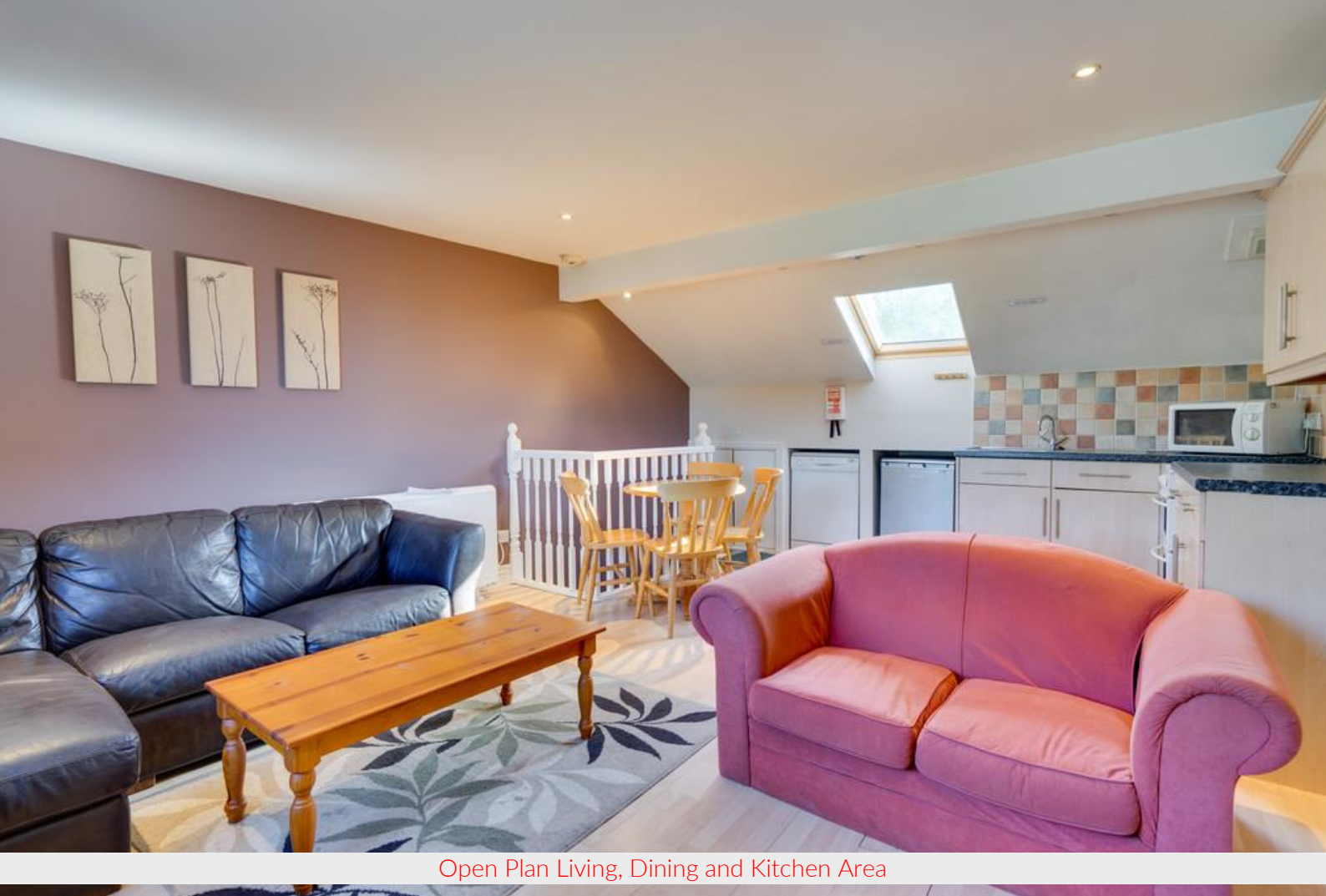
Open Plan Living, Dining and Kitchen Area

Location: Situated immediately next door to the Hackney & Leigh Ambleside Office on Rydal Road.