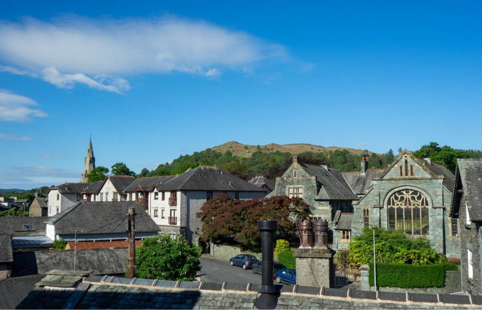
View from Living Room