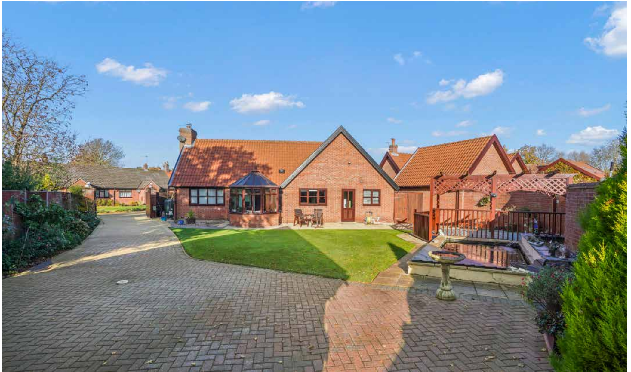
Saddleback Lodge Bulls Green Lane | Toft Monks | Norfolk | NR34 0FR