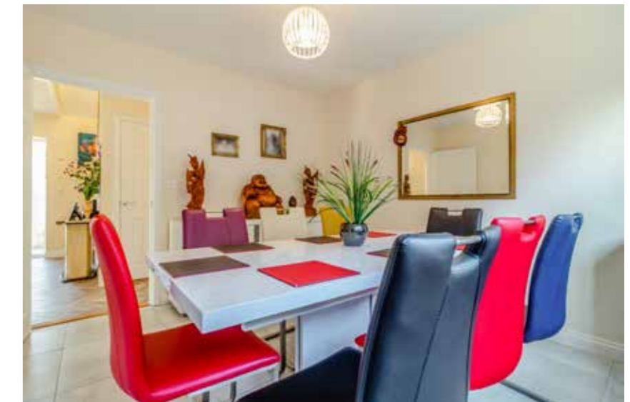
A Contemporary Space