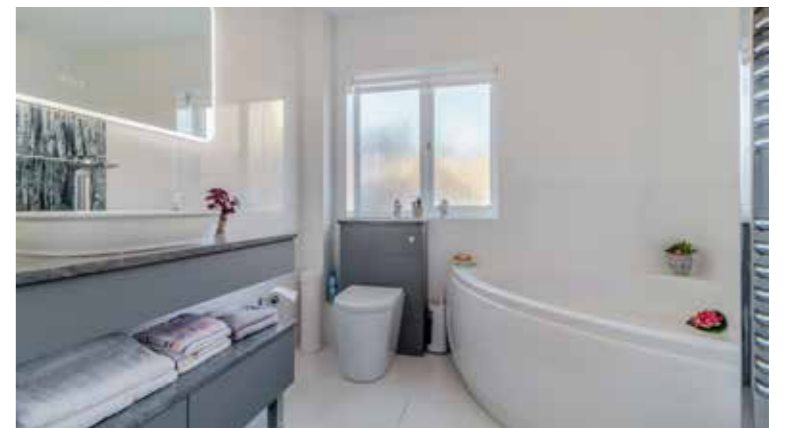
The first floor is a delightfully spacious and light filled space with views over the village. The principal bedroom is very large and benefits from four built in wardrobes and a wallpapered feature wall above the built in dressing table. There is more than enough room for a cosy armchair or two, ideal for daydreaming and there is also useful eaves storage. The bedroom is enhanced by the presence of a really smart en suite shower room flooded with natural light via a skylight. There is a generous walk in shower, a counter top basin and a chrome towel rail. The second bedroom is also a very good size with eaves storage. It is presently used as the grandchildren's bedroom, but if desired, it would work very well as a hobby room, den or teenage hangout.