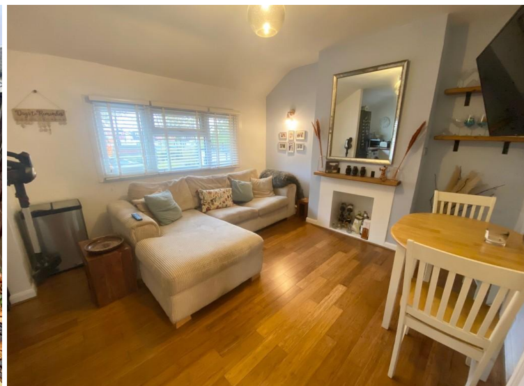
49B Ross Road, Wallington, Surrey, SM6 8QP | £315,000 Leasehold

Paul Graham are pleased to present this first floor apartment which is situated within a short walk of Wallington town centre and station which offers links to London. The property which occupies the whole of the first floor boasts two double bedrooms, an open plan kitchen/living/dining area which is ideal for entertaining and a modern bathroom. Outside the property benefits from parking and a private rear garden. Long lease.