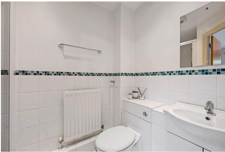
BATHROOM 6' 10" x 6' 6" (2.1m x 2m)