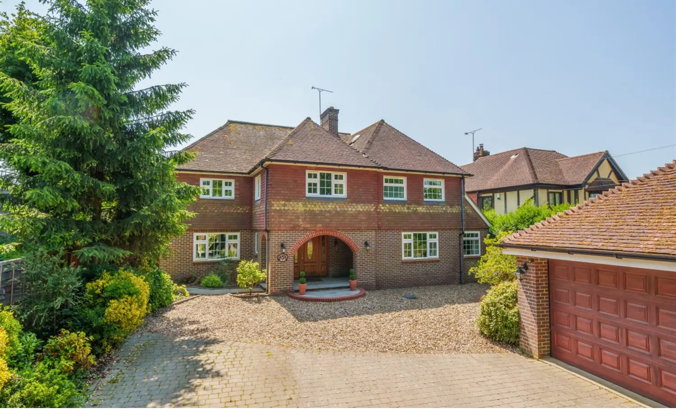
Meadowlands Winterpit Lane, Mannings Heath Guide Price £1,150,000