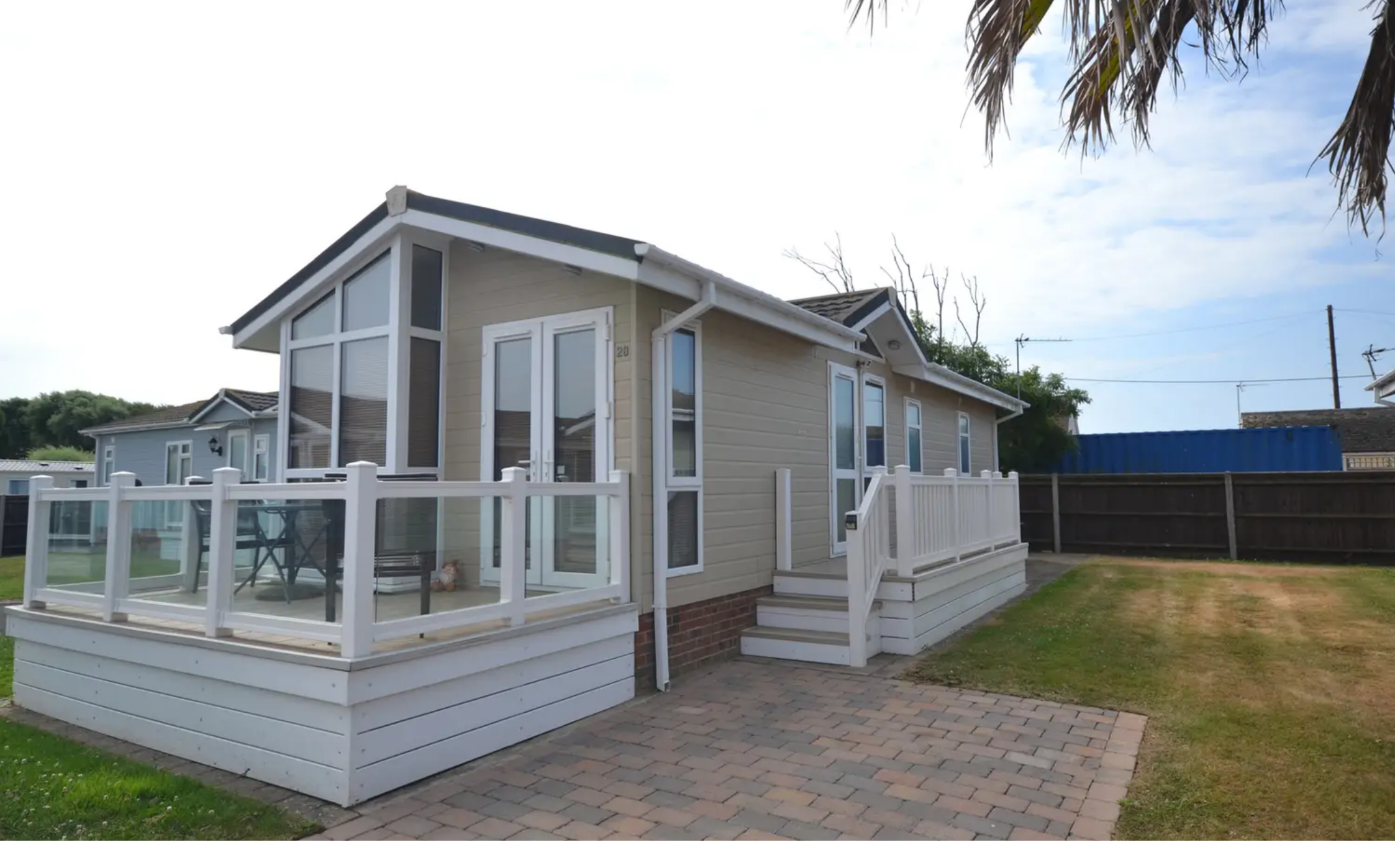
28 Pebble Beach Park, Warners Lane, Selsey Guide Price £82,000