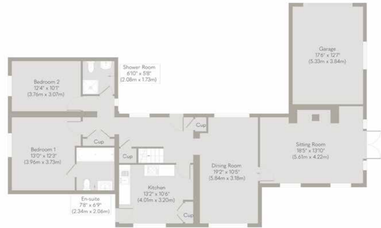
Ground Floor Approximate Floor Area 1379 sq. ft (128.11 sq. m)

Whilst every attempt has been made to ensure the accuracy of the floor plan contained here, measurements of doors, windows, rooms and any other items are approximate and no responsibility is taken for any error, omission, or mis-statement. This plan is for illustrative purposes only and should be used as such by any prospective purchaser or tenant. The services, systems and appliances shown have not been tested and no guarantee as to their operability or efficiency can be given.