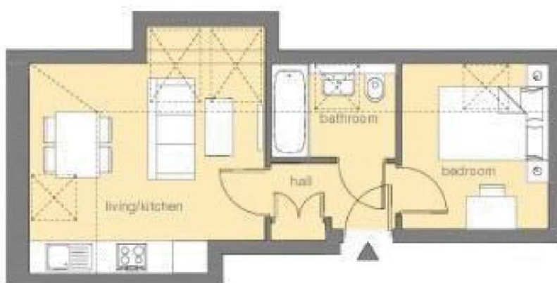
Floor plan location

Total Gross Internal Area = 29.64 sqm 319 sq ft