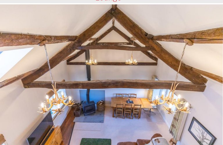
View into Lounge from Mezzanine