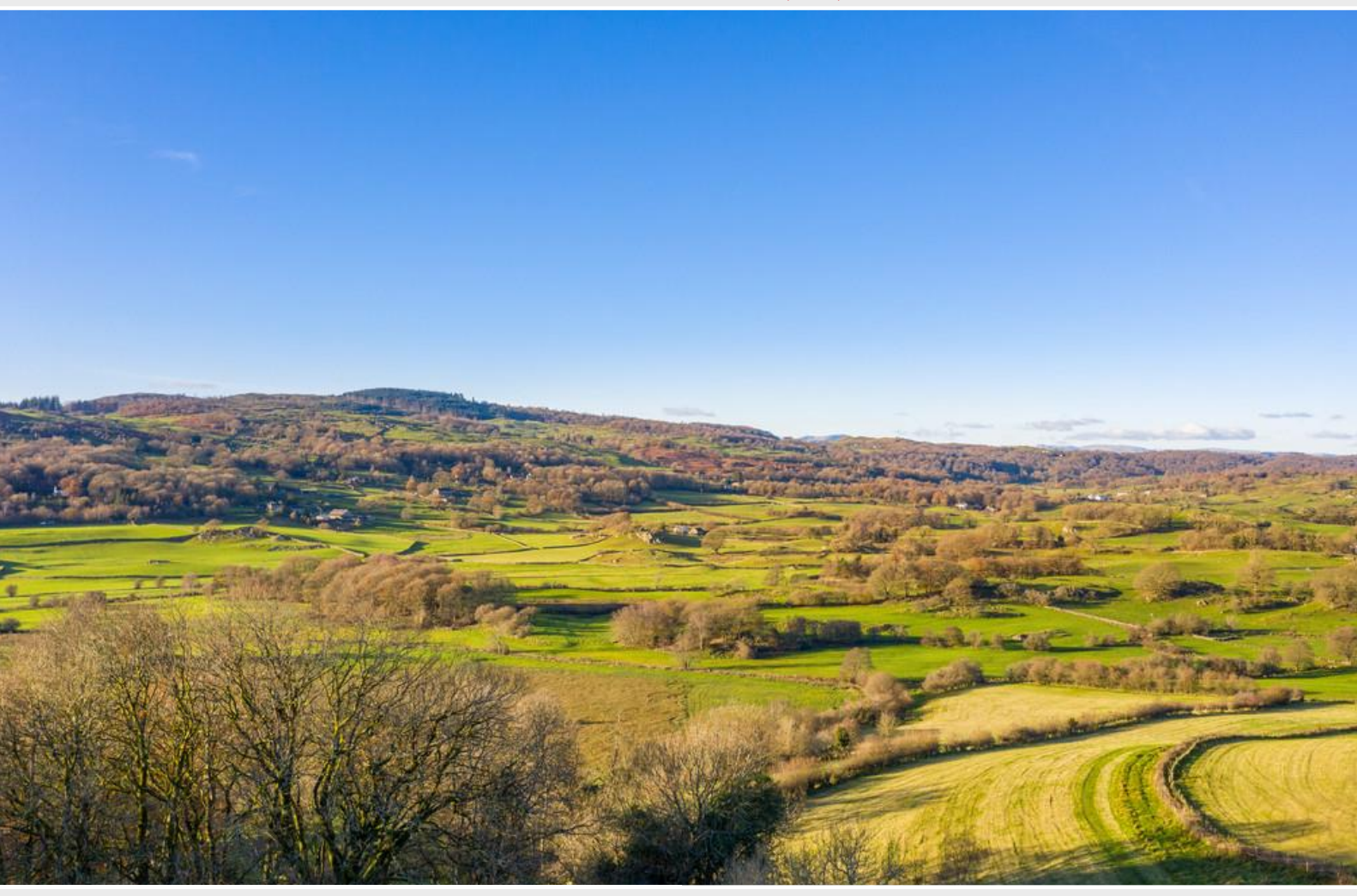
Views from Field at the front of the property