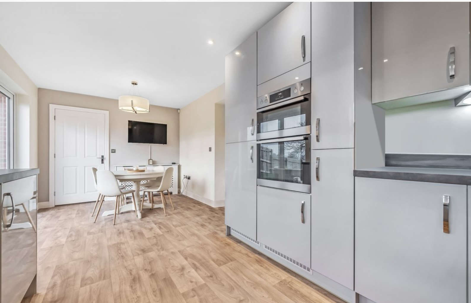
Open Plan Dining Kitchen