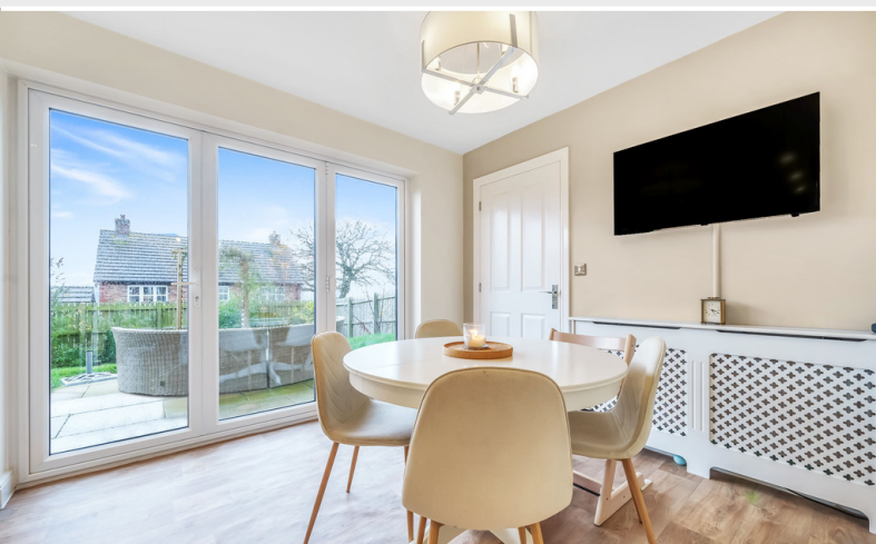
Open Plan Dining Kitchen