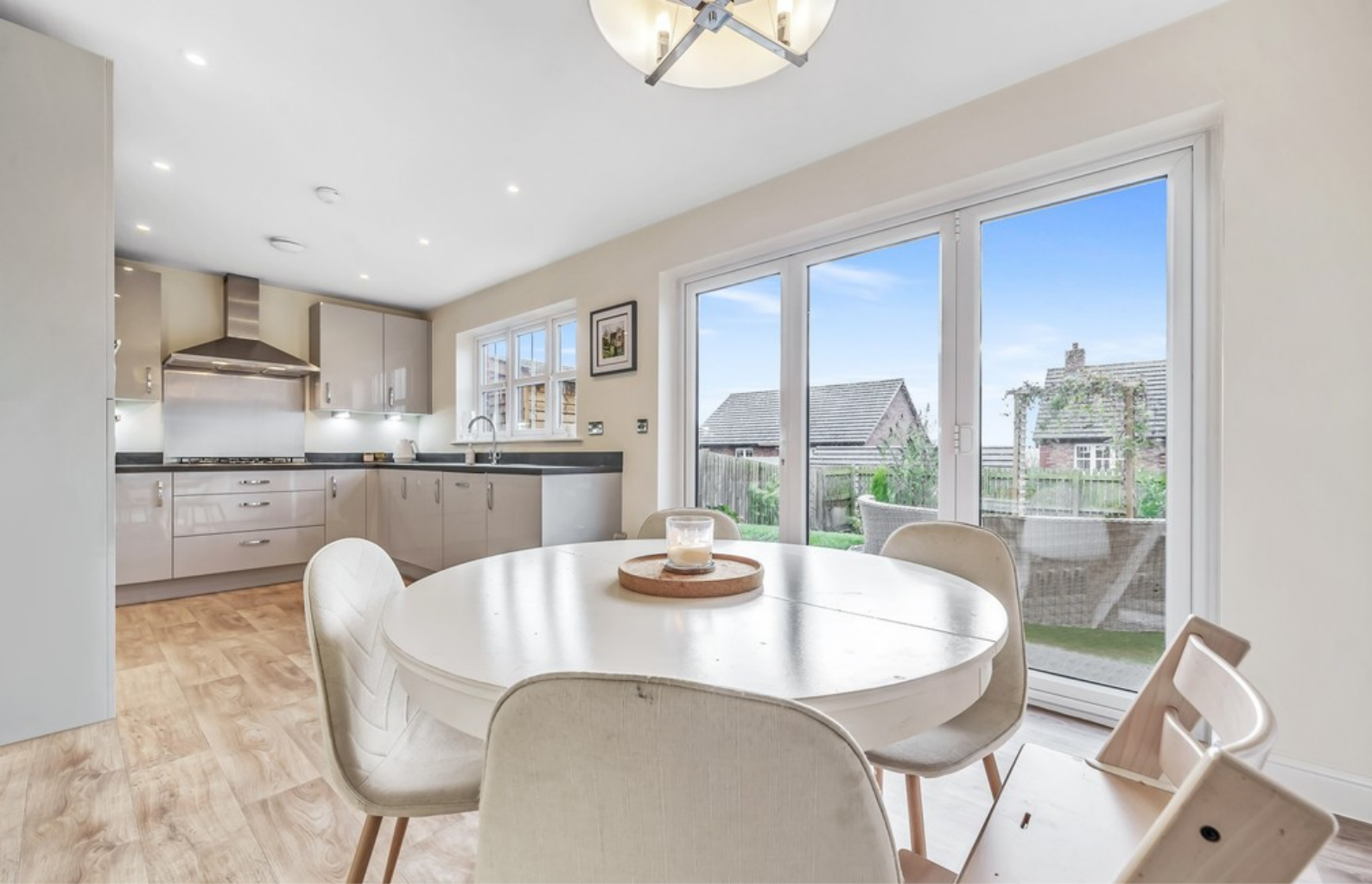
Open Plan Dining Kitchen