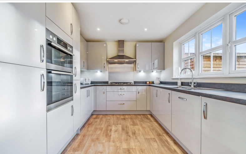
Open Plan Dining Kitchen