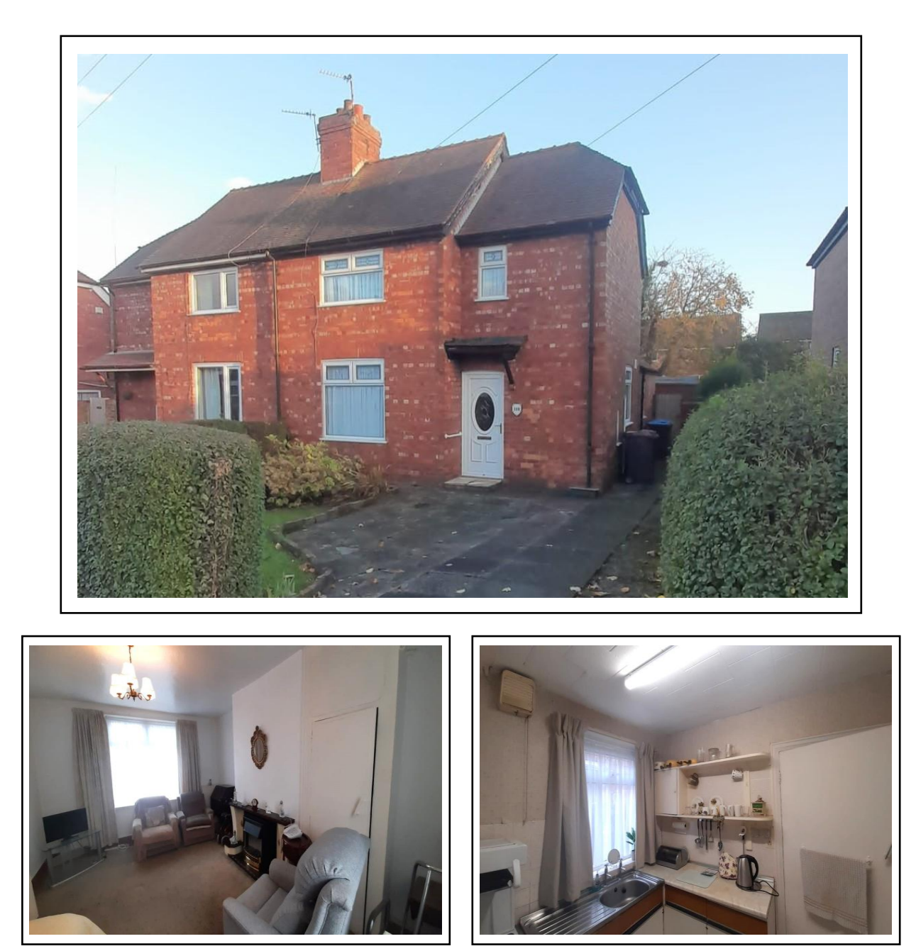
119 Gladstone Street, Winsford, Cheshire, CW7 4AU £140,000

No Onward Chain.... This traditional three bedroom semi detached property is situated in a popular residential area and is within walking distance of the local schools, shops and other amenities close to hand as well as easy access to commuter routes. In need of modernisation the property briefly comprises entrance hall, lounge/diner, kitchen and bathroom on the ground floor whilst to the first floor there are three bedrooms. Externally the property is approached via a driveway to provide off road parking and has mature gardens to the front and rear.