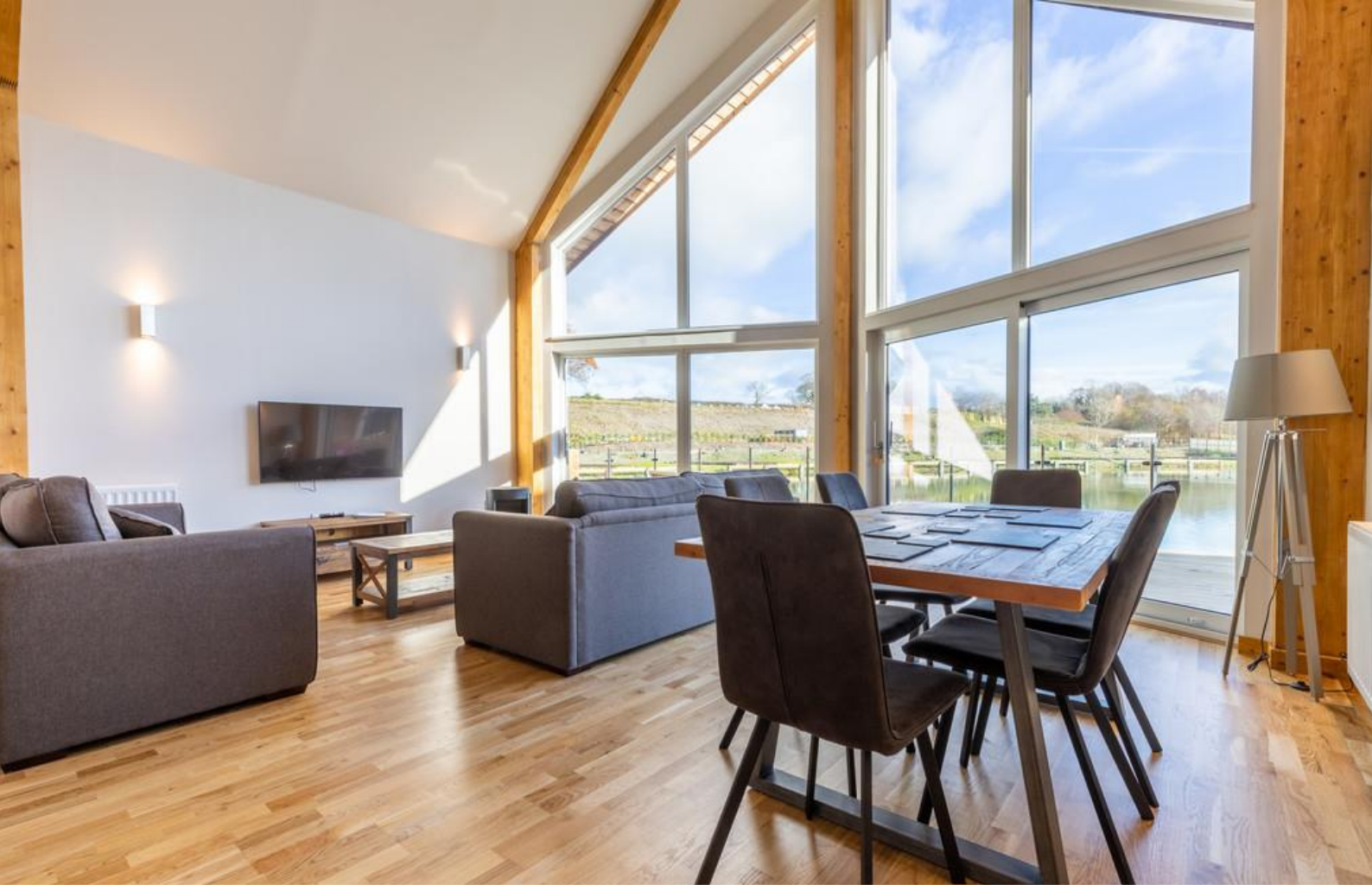
Open Plan Living