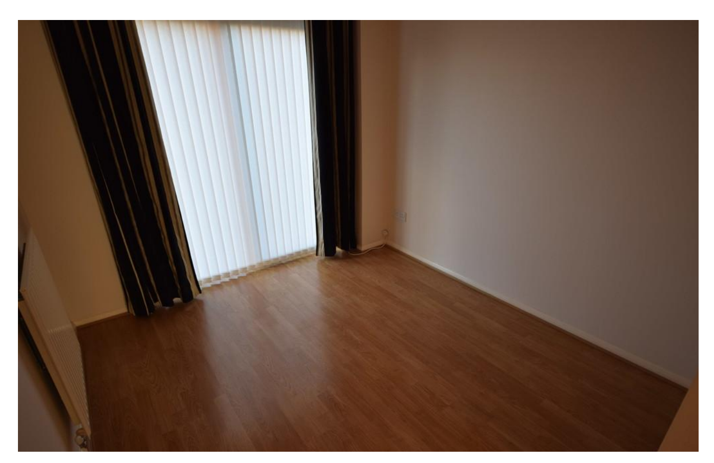
Tansey Close, Bucknall 4 Bedrooms, 2 Bathroom