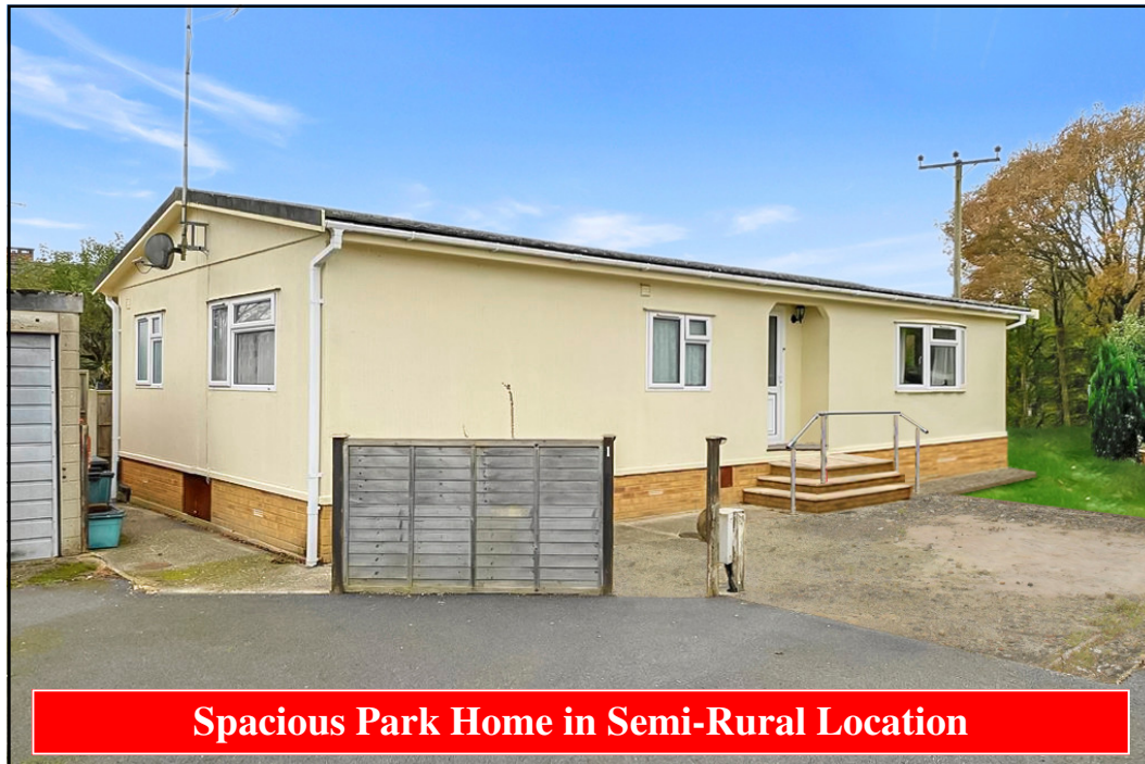
Spacious Park Home in Semi-Rural Location

1 Slepe Park, Dorchester Road, Lytchett Minster, Poole. BH16 6HT