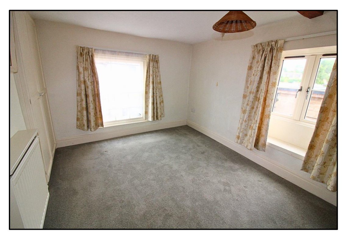
Bedroom Two measuring approximately 10'5" x 6'0" (3.20m x 1.82m) minimum with rear elevation window, panelled radiator, light and power points. (Access hatch to roof void)

Bedroom One measuring approximately 11'7" x 9'2" (3.56m x 2.80m) with dual aspect windows, exposed ceiling beam and pendant light. Built-in wardrobe cupboards with shelves and hanging space. TV aerial socket, panelled radiator and power points. Pull cord light switch.