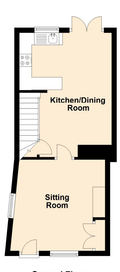
Ground Floor Approx. 43.4 sq. metres (467.2 sq. feet)