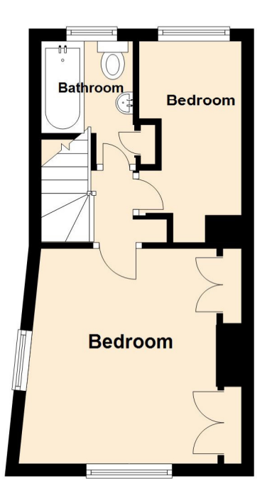
First Floor Approx. 23.3 sq. metres (250.5 sq. feet)