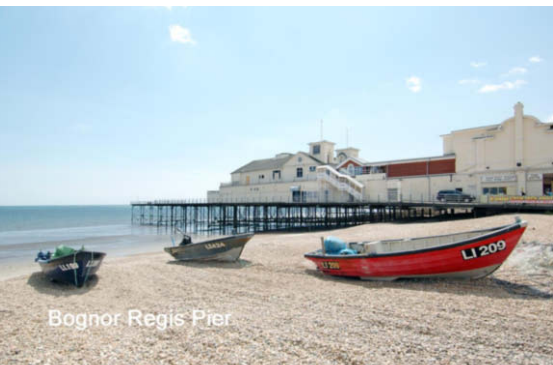
Bognor Regis Pier