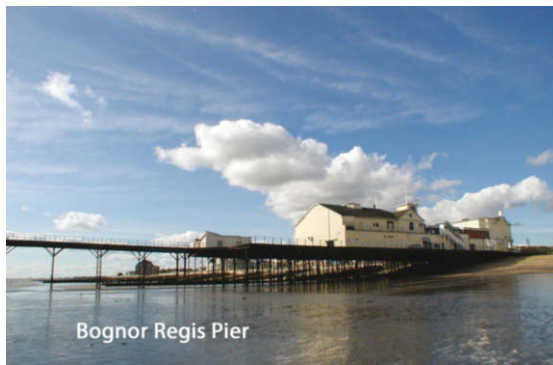
Bognor Regis Pier