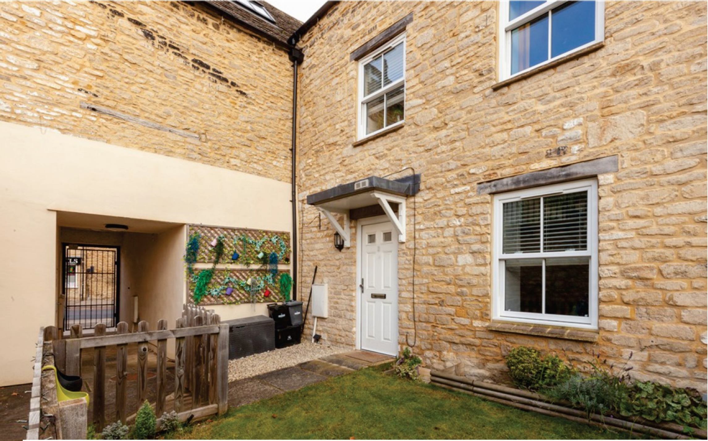
Jones Mews, Witney