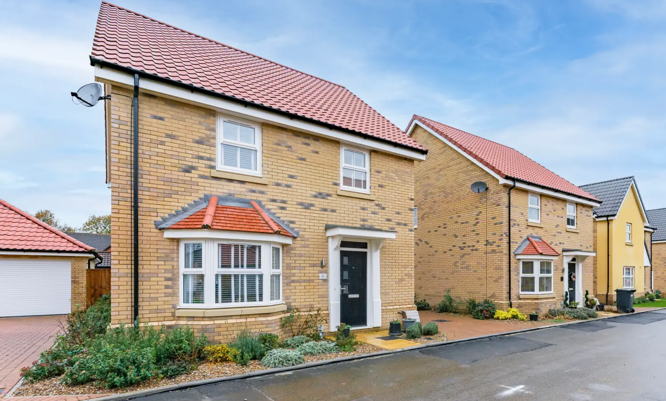
6 Crispin Road, Dereham £340,000