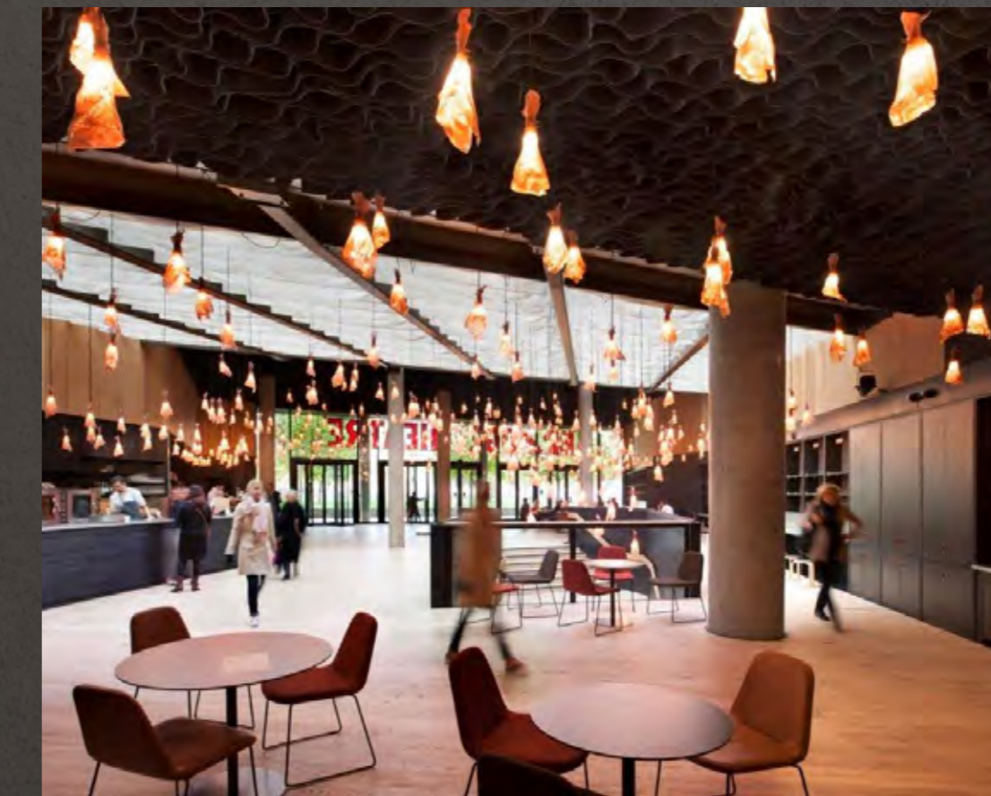
The Bridge Theatre