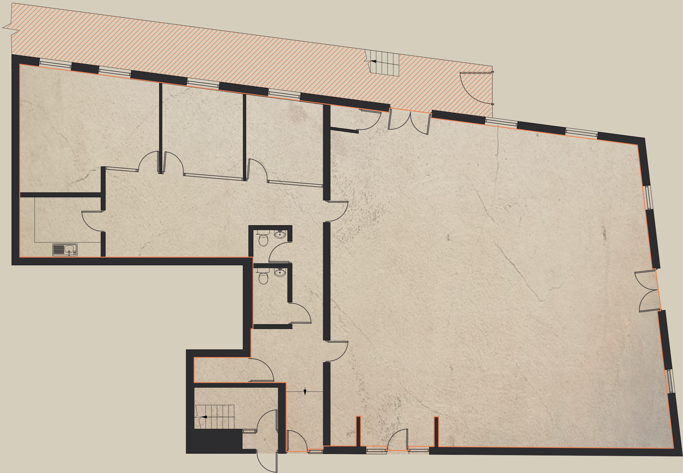
GROUND FLOOR 3,030 SQ.FT