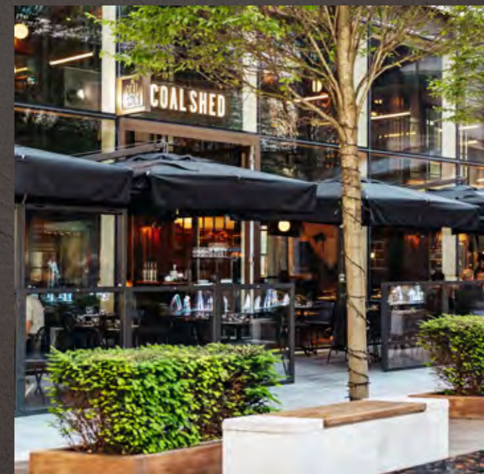
The Coal Shed