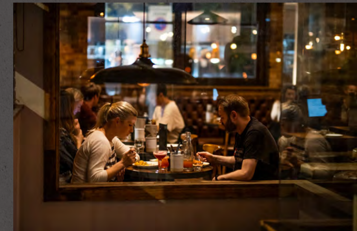
Flour & Grape