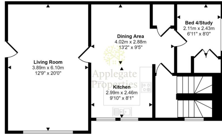
First Floor Approx 59 sq m / 631 sq ft

This floorplan is only for illustrative purposes and is not to scale. Measurements of rooms, doors, windows, and any items are approximate and no responsibility is taken for any error, omission or mis-statement. Icons of items such as bathroom suites are representations only and may not look like the real items. Made with Made Snappy 360.