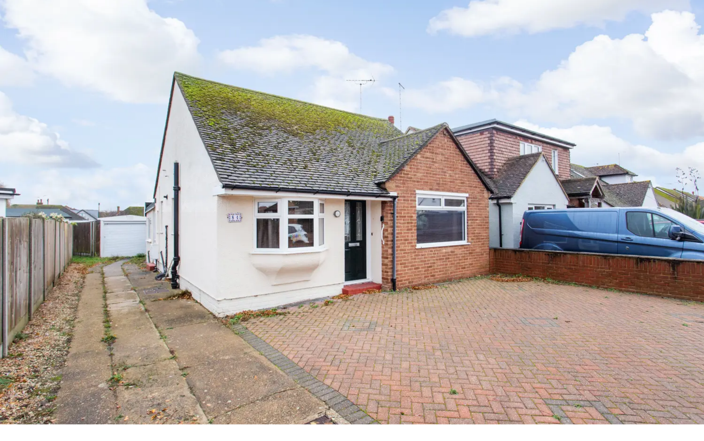
84 Poplar Drive, Herne Bay £325,000