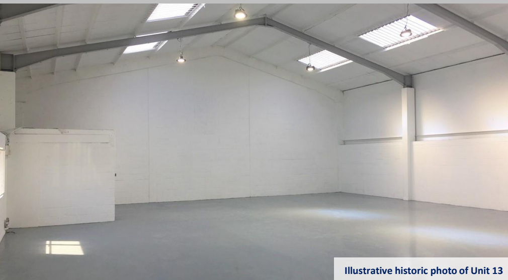
Illustrative historic photo of Unit 13