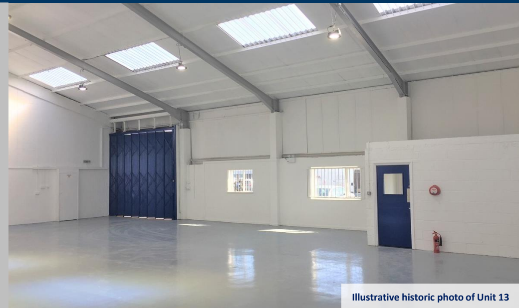
Illustrative historic photo of Unit 13