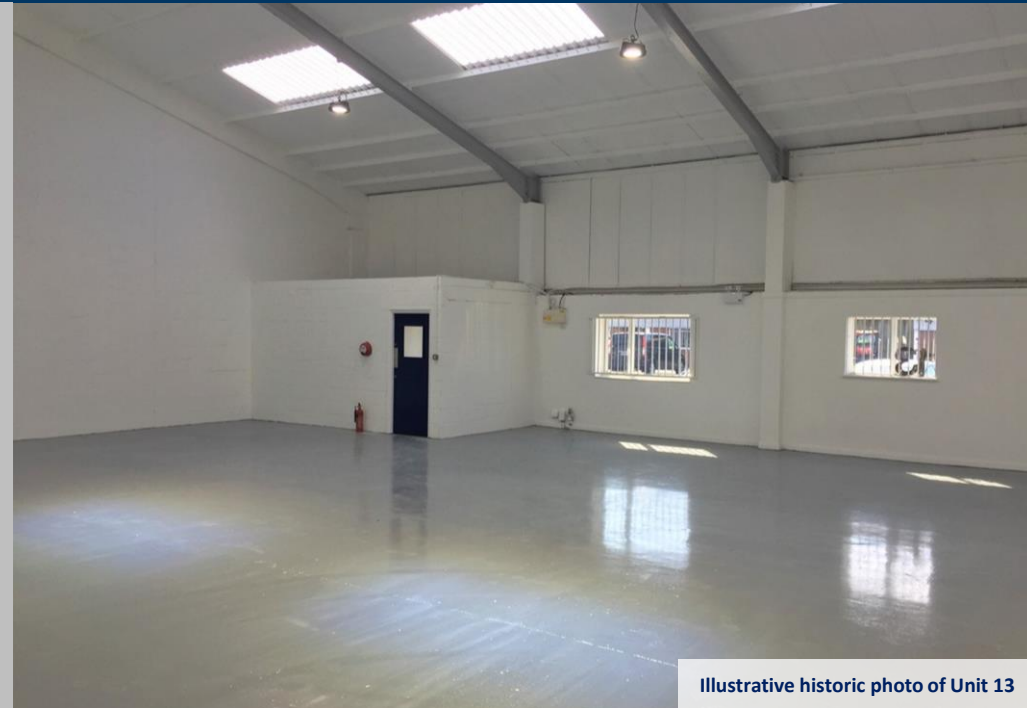
Illustrative historic photo of Unit 13

An EPC has been commissioned – further details available from the agents.