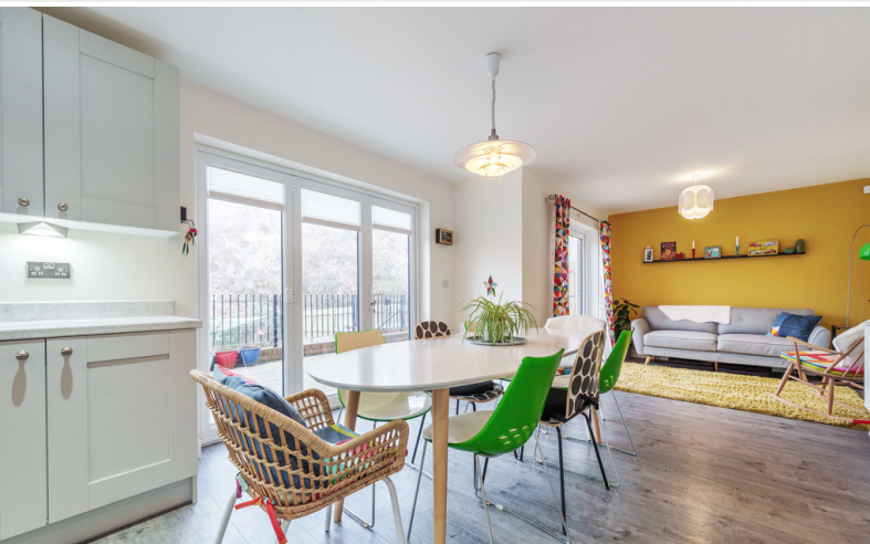
Open Plan Dining Kitchen / Sitting Room