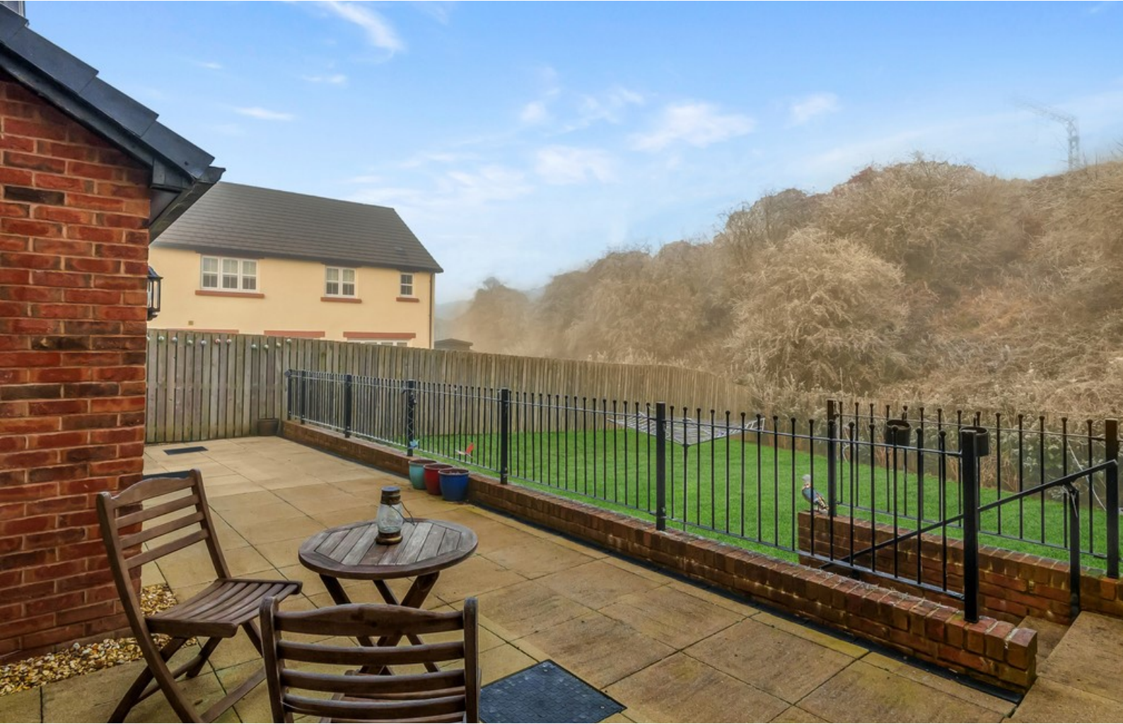
Rear Terrace and Garden