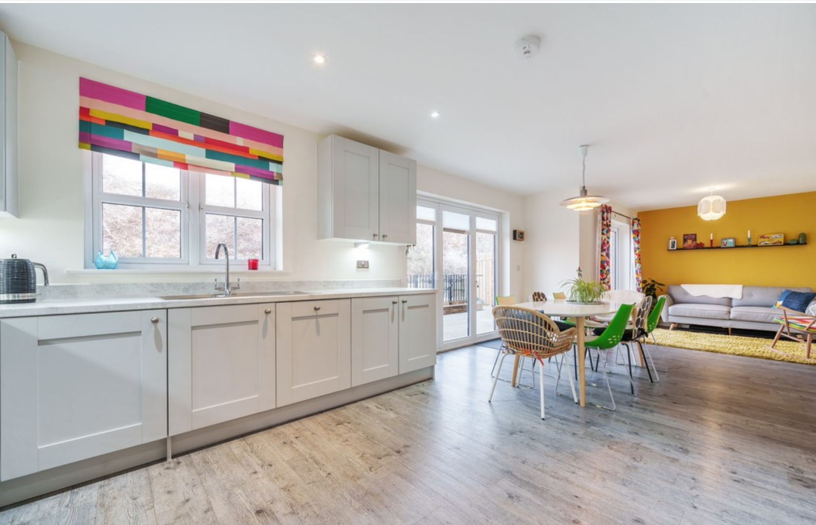
Open Plan Dining Kitchen / Sitting Room