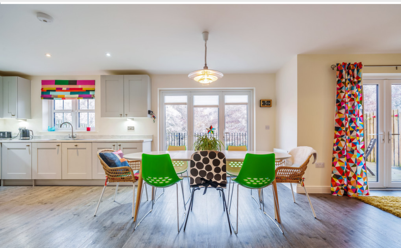
Open Plan Dining Kitchen / Sitting Room