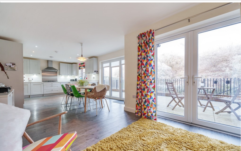
Open Plan Dining Kitchen / Sitting Room

An attractive style modern detached four bedroom house constructed by the acclaimed Story Homes and pleasantly situated on a peaceful cul de sac within the desirable Jacobite Gardens residential estate in Clifton village located under three miles from Penrith town centre with convenient access to the M6 and Lake District National Park. The village amenities include a primary school, village hall and the award-winning George and Dragon public house.