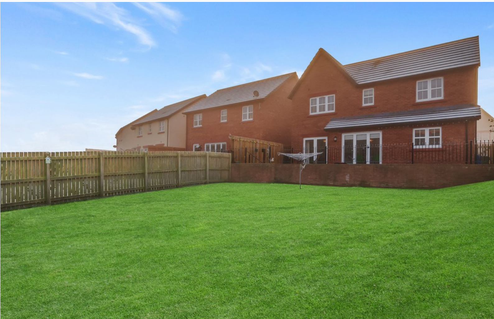
Rear Elevation and Garden

Request a Viewing Online or Call 01768 593593