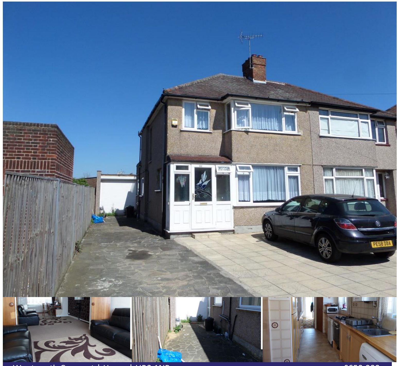
Wentworth Crescent | Hayes | UB3 1NR