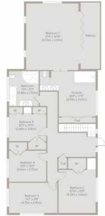
First Floor Approximate Floor Area 1635 sq. ft. (151.89 sq. m)