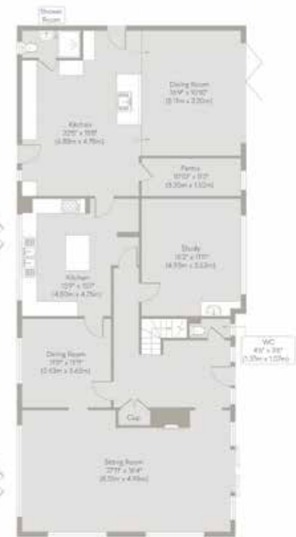
Ground Floor Approximate Floor Area 1920 sq. ft. (179.11 sq. m)