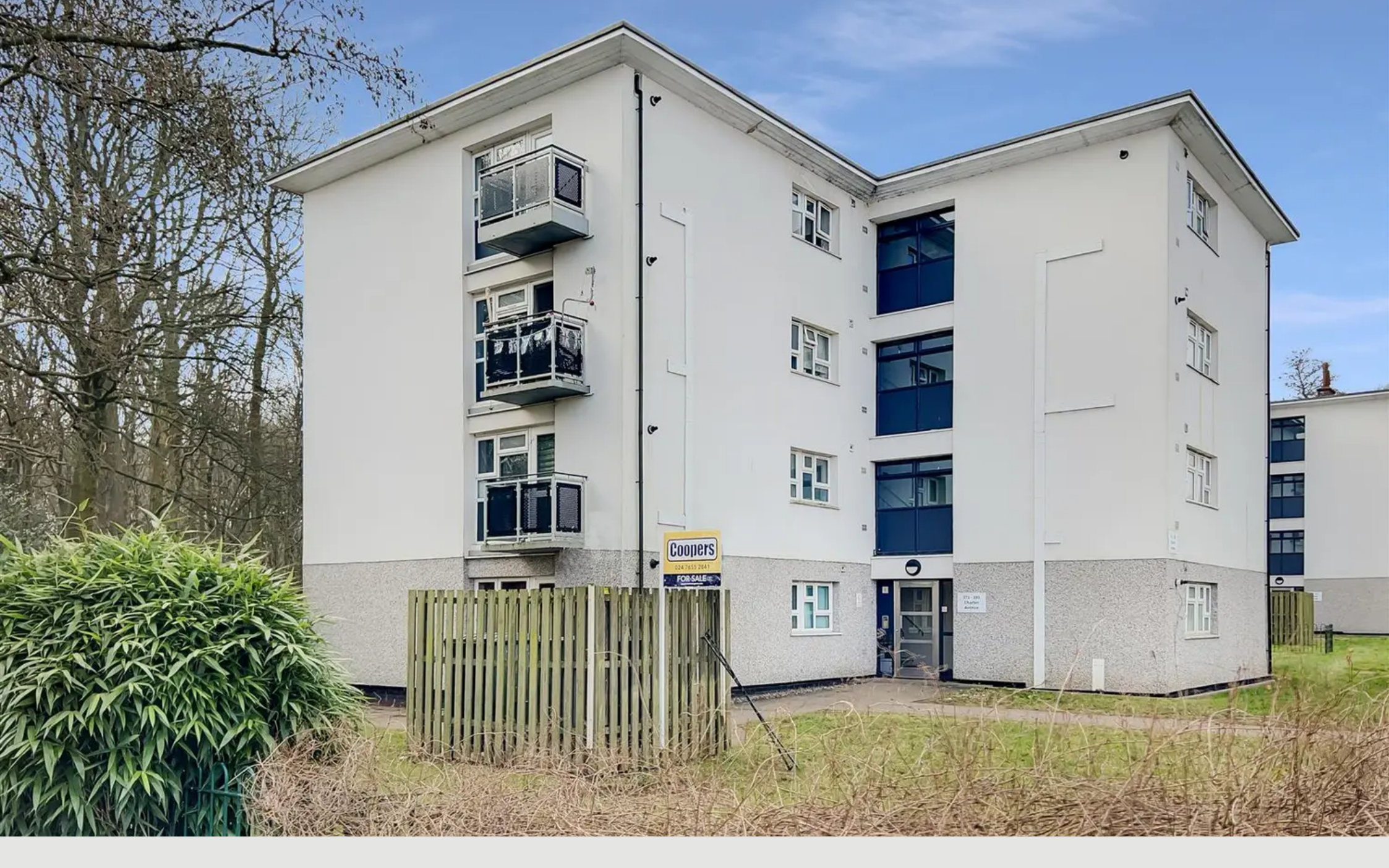
Charter Avenue, Canley, Coventry CV4 8BB £140,000