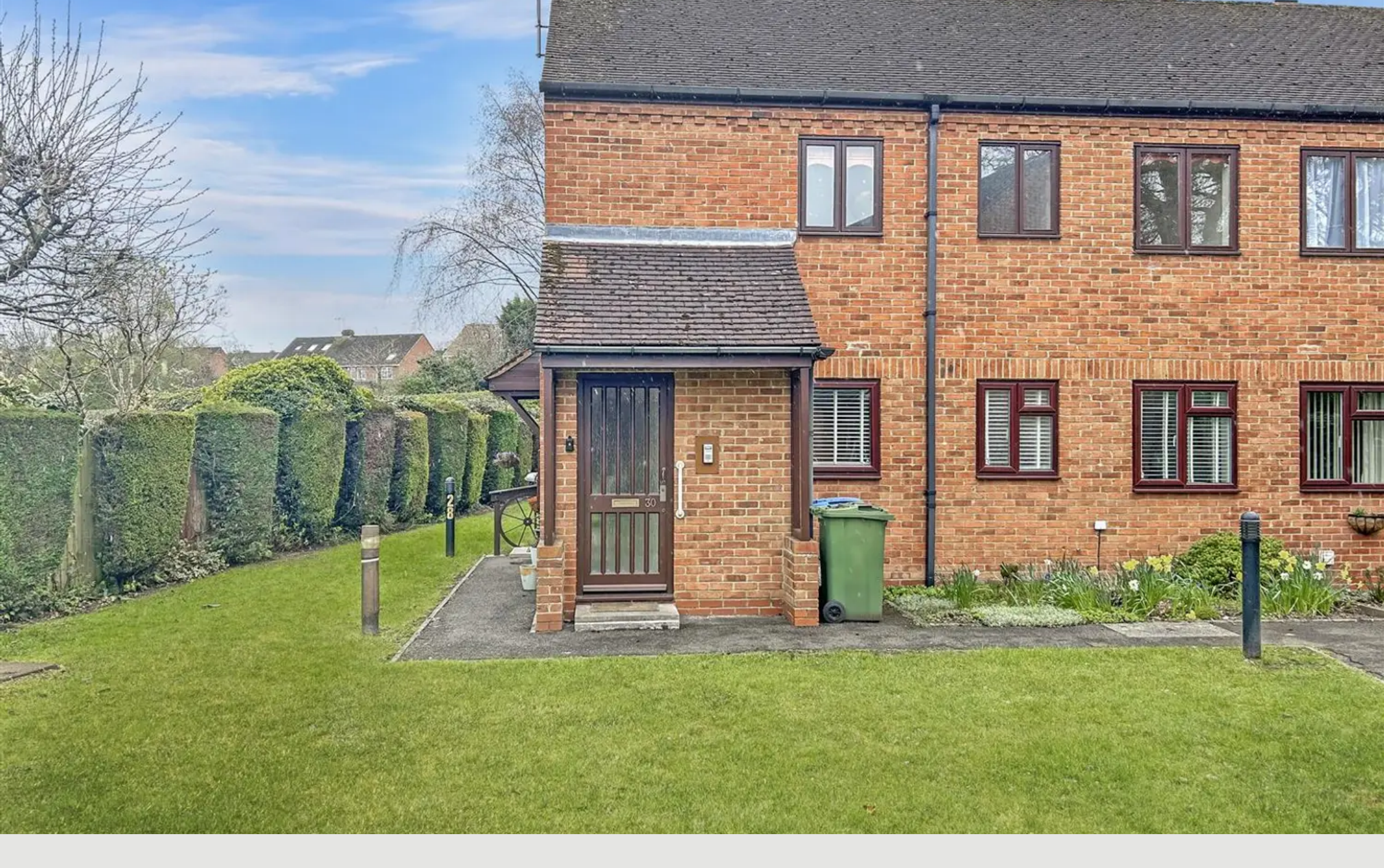
Brentwood Gardens, Brentwood Avenue, Finham, Coventry CV3 6AS