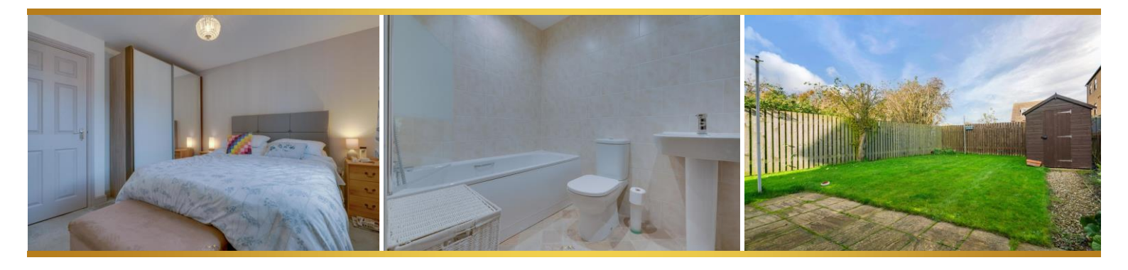
GROUND FLOOR 422 sq.ft. (39.2 sq.m.) approx.