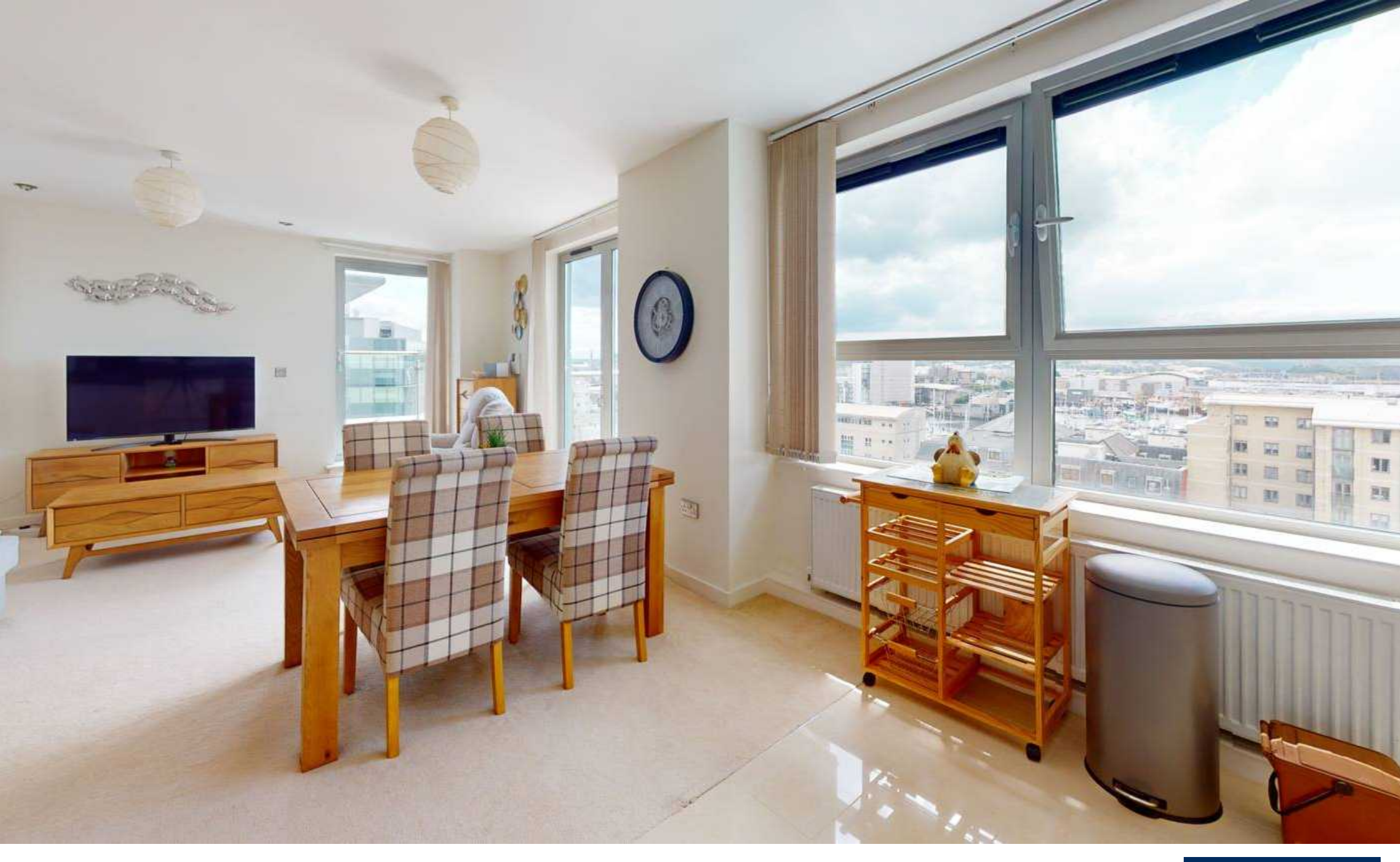
11 Moon Street, Plymouth, PL4 0AL