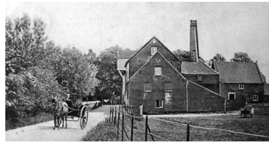
A historic photo of The Water Mill and Engine House

“The Engine House is part of the Burnham Water Mill and retains all its character and charm.”