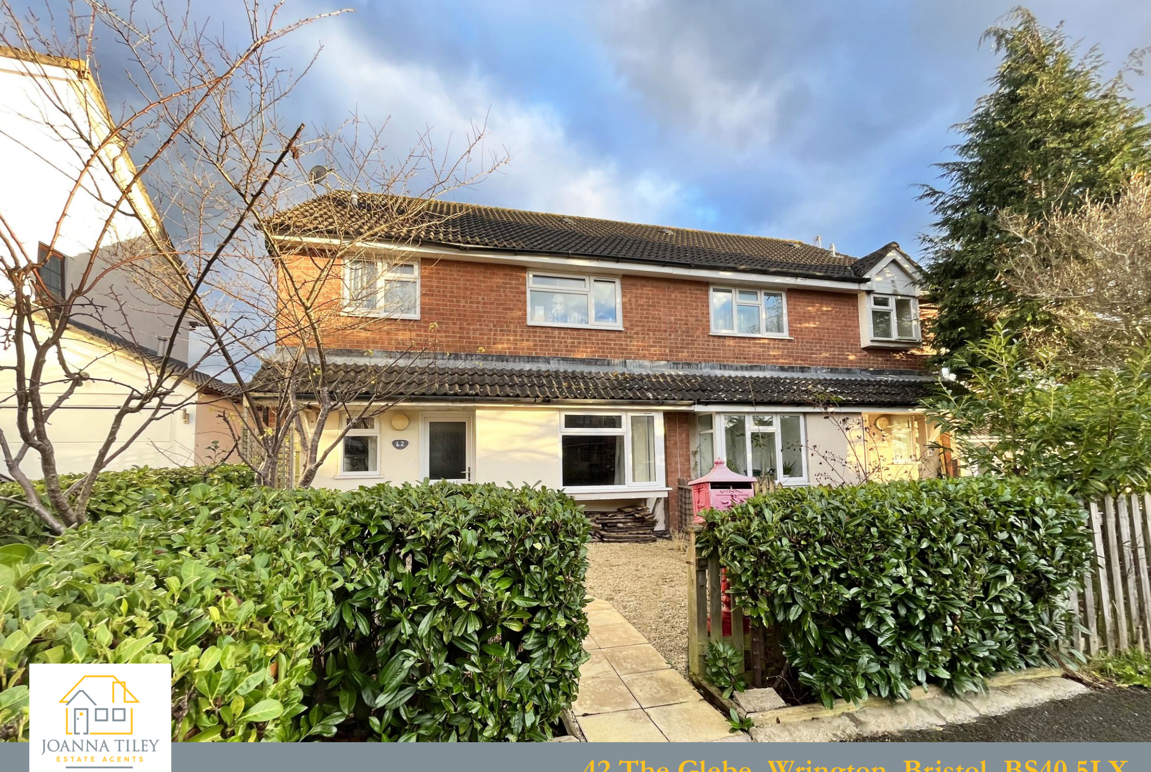
42 The Glebe, Wrington, Bristol, BS40 5LX