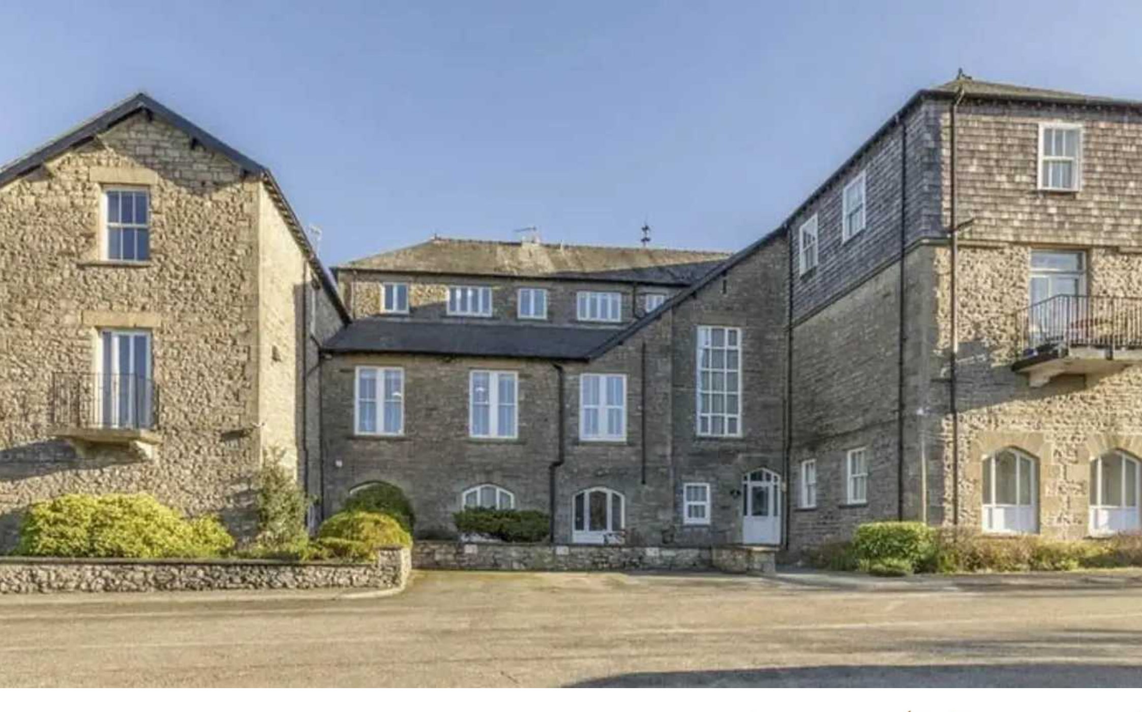
Flat 7, Glebe Court, Kirkby Lonsdale £300,000