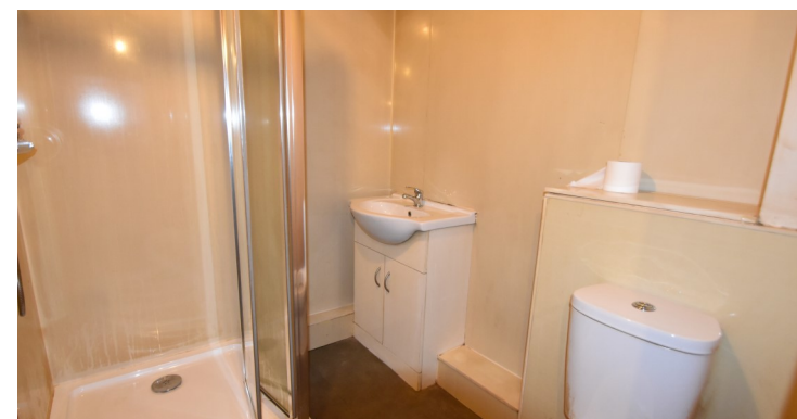
35 Young Crescent